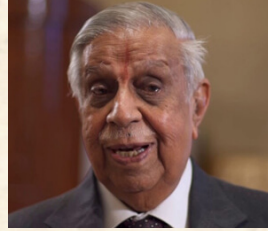
Justice Shri M.N. Venkatachaliah Former Chief Justice of India Chairman Selection Jury