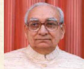
1998 - 4 th Award His Excellency Shri. Krishan Kant Vice President of India