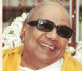
1999 - 5 th Award Dr. M. Karunanidhi Hon'ble Chief Minister of Tamil Nadu