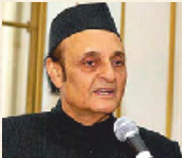
1997- 3 rd Award Shri. Karan Singh Hon'ble Member of Rajya Sabha