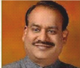
2022 - 24 th Award Shri Om Birla Honourable Speaker of Lok Sabha