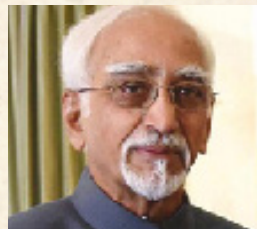
2013 - 16 th Award His Excellency Shri. M. Hamid Ansari Vice President of India