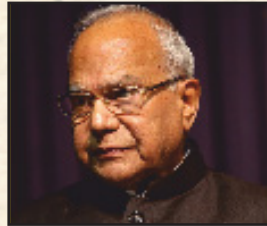
2021- 22 nd & 23 rd Award His Excellency, Thiru. Banwarilal Purohit Governor of Tamil Nadu