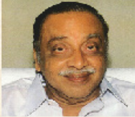
2000 - 6 th Award Shri. P.T.R. Palanivelrajan Hon'ble Speaker of Tamil Nadu Legislative Assembly