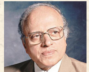
Prof. M.S. Swaminathan Chairman Emeritus, M.S. Swaminathan Research Foundation, Chennai