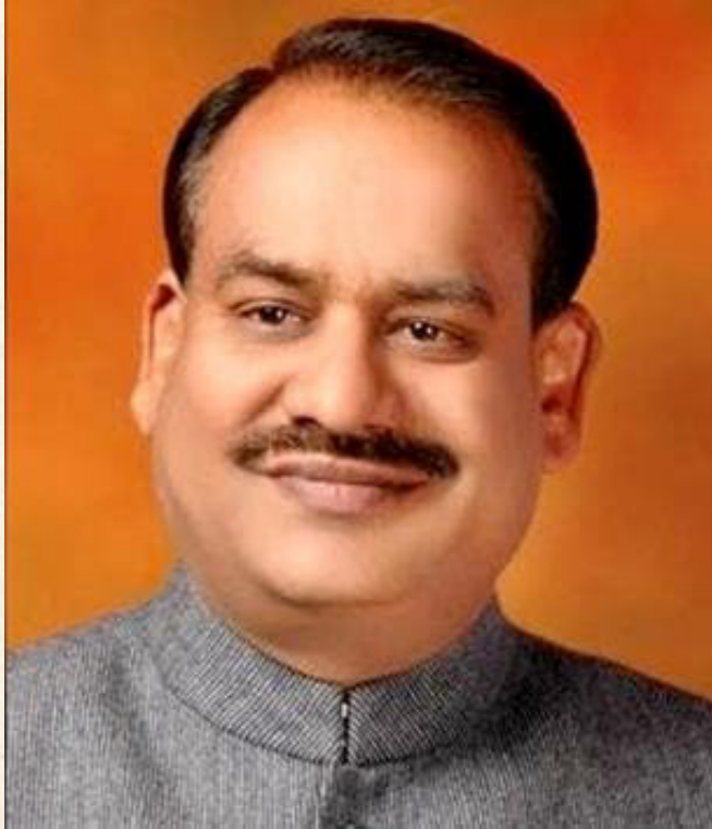
Shri OM BIRLA Honourable Speaker of Lok Sabha

Chief Guest of 24 th Mahaveer Awards Presentation Function on 2 nd March 2022