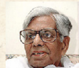
1996 - 2 nd Award Shri. C. Subramaniam Former Governor of Maharashtra