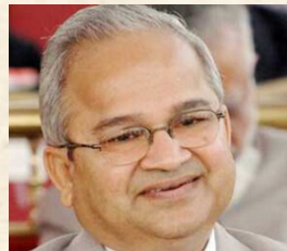
Justice Shri G.S. Singhvi Former Judge of Supreme Court of India