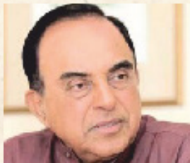
2017- 20 th Award Dr. Subramanian Swamy Hon'ble Member of Rajya Sabha