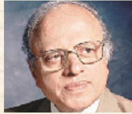
2010 - 13 th Award Prof. M.S. Swaminathan Chairman Emeritus M. S. Swaminathan Research Foundation, Chennai