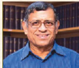
2016 - 19 th Award Shri. S. Gurumurthy Editor Thuglak, Part-time Director of RBI