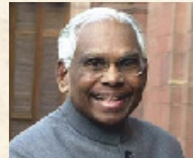
1995 -1 st Award His Excellency Shri. K.R. Narayanan Vice President of India