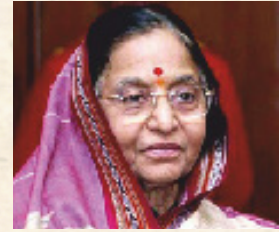
2008 - 11 th & 12 th Award Her Excellency, Smt. Pratibha Patil President of India