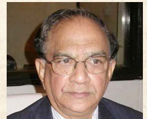
Shri T.S. Krishnamurthy, Former Chief Election Commissioner of India