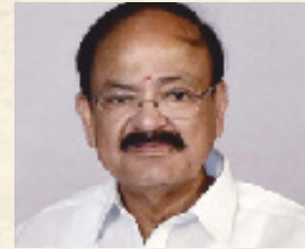
2018- 21 st Award His Excellency Shri M. Venkaiah Naidu Vice President of India