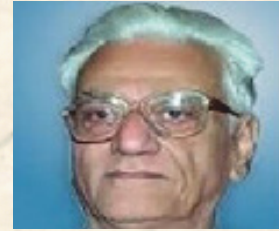
2003 - 7 th & 8 th Award His Excellency Shri. K.R. Malkani Lt. Governor of Pondicherry