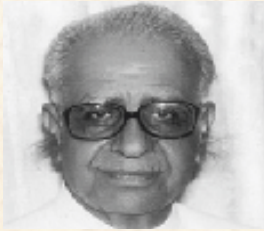
2006 - 10 th Award His Excellency, Shri. T.N. Chaturvedi Governor of Karnataka