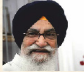
2005 - 9 th Award His Excellency Shri. Surjeet Singh Barnala Governor of Tamil Nadu