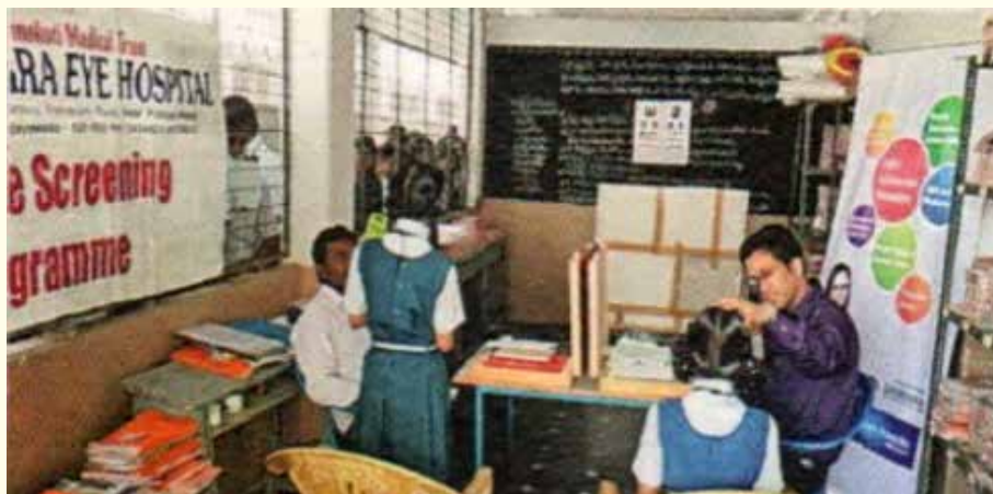
Eye Screening for School Children