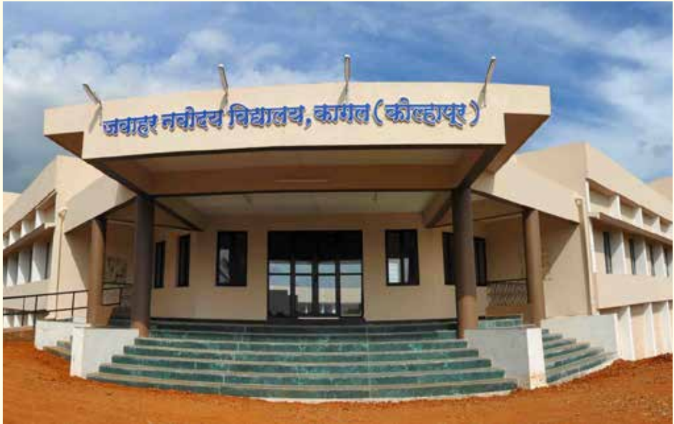
Jawahar Navodaya Vidyalaya, Kagal, District Kolhapur, Maharashtra