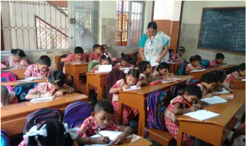
Students Writing - SJNS Nursery & Primary School, Big Street, Triplicane