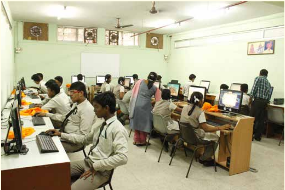
In Computer Lab – SJNS Higher Secondary School, Ganapathy Street, Triplicane