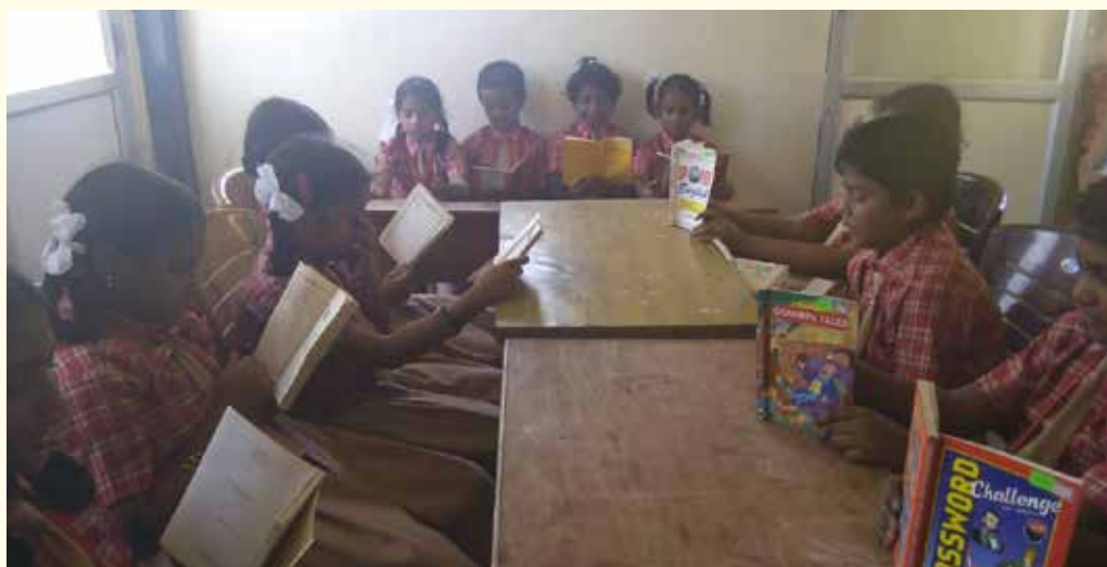
Students Reading – SJNS Nursery & Primary School, Ponnappa Lane, Triplicane.

The three schools have a total strength of 1580 students. The Schools have good infrastructure, well-appointed Science laboratory, library, Computer Lab, indoor playground, auditorium and dedicated teachers. Quality Education is provided with focus on overall development of the students. Extracurricular activities and character building form part of the daily activities of the School. This year the Higher Secondary School posted 100% pass results in the X Standard and XII Standard Board Examinations. The Trust has granted donations and scholarships worth Rs. 35 Lakhs to the needy.