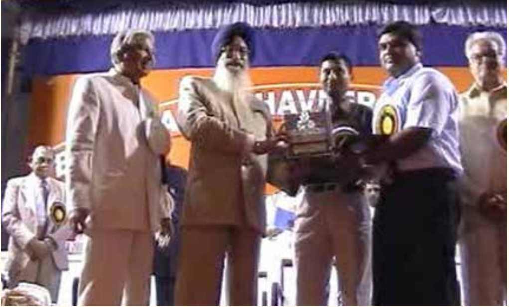
9th Mahaveer Award - His Excellency Shri Surjeet Singh Barnala, Governor of Tamil Nadu, presenting the award to Swami Vivekananda Youth Movement, Karnataka on 14.02.2005 at Chennai.