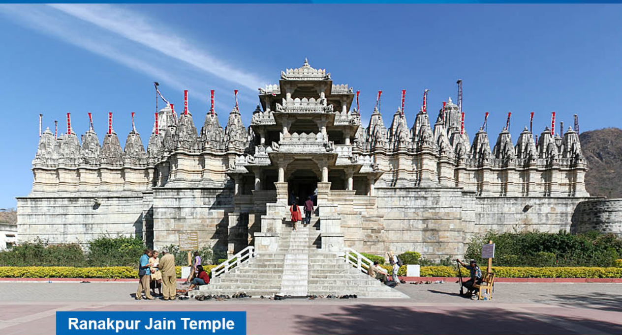
Ranakpur Jain Temple