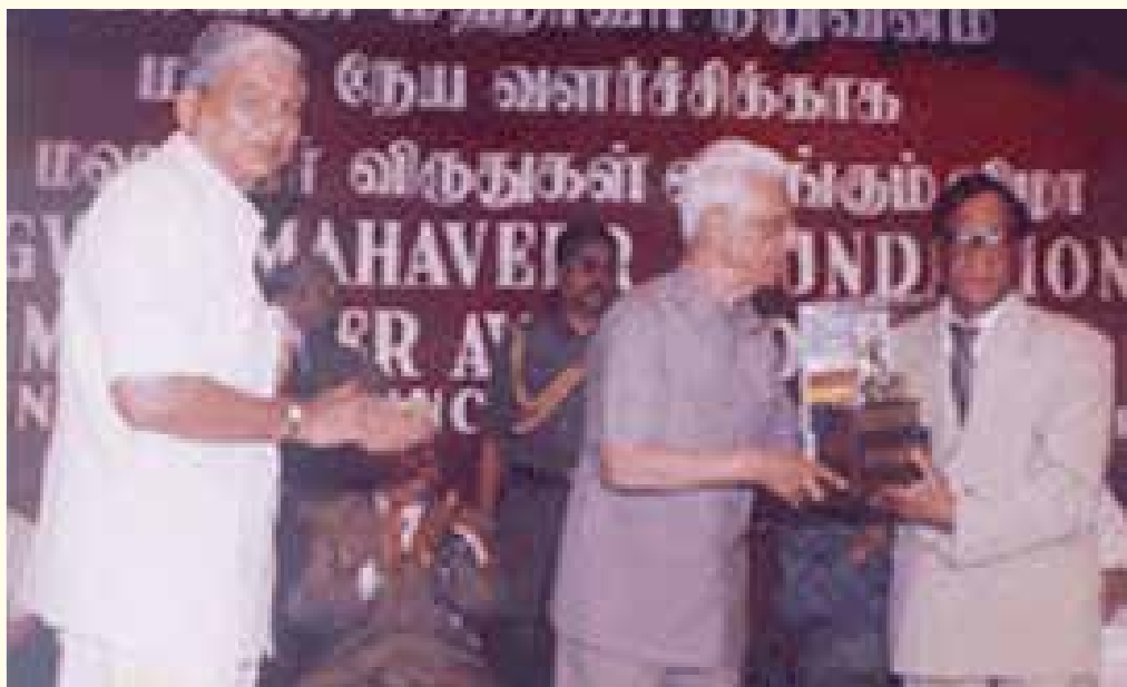
8th Mahaveer Award - His Excellency Shri K R Malkani, Lt. Governor of Pondicherry, presenting the award to Marudhar Mahila Shikshan Sangh, Pali, Rajasthan, on 22.03.2003 at Chennai.