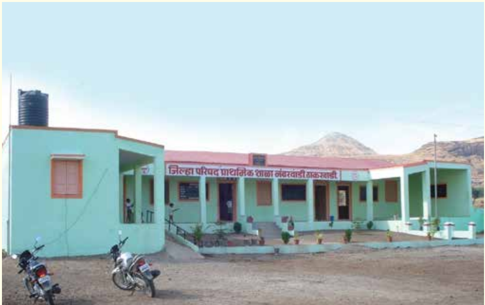
Z.P. Primary School , Numberwadi, District Pune, Maharashtra