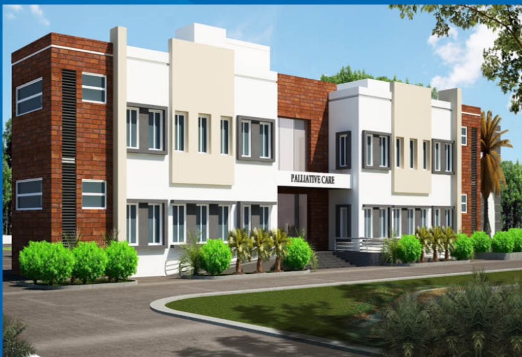
PALLIATIVE CARE CENTRE AT SRIPERUMBUDUR