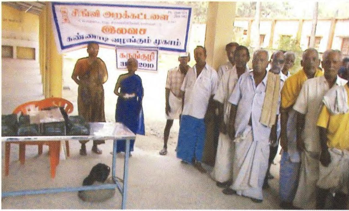
Patiently waiting patients at one of the Eye Camps conducted by Singhvi Charitable Trust.