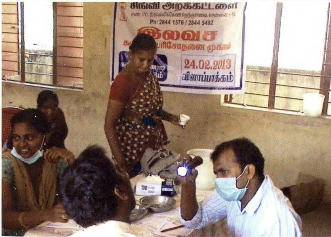
Providing dental relief at one of the camps of Singhvi Charitable Trust.