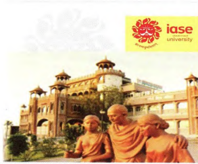
Gandhi Vidya Mandir, Churu, Rajasthan

Aimed at “Lighting the lamp where it is darkest” Gandhi Vidya Mandir (GVM) was established in 1950 at Churu, Rajasthan to serve about 200 surrounding villages. With its primary objective of providing education in the remote rural area from pre-primary class to Ph.D., GVM has successfully been working for the cause of education, rural welfare and empowerment of women. Further, through nearly 100 village centres, over 3000 boys and girls (in the age group of 6 to 14 years) are being extended Non-Formal Education.