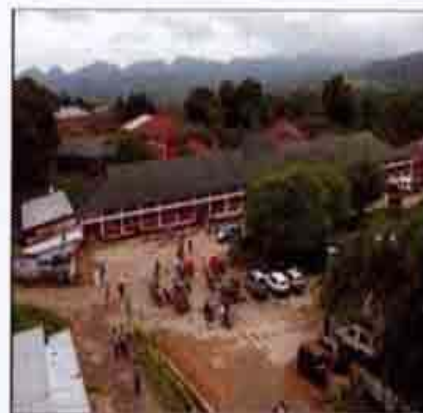
Ramakrishna Mission Hospital, Arunachal Pradesh