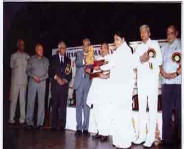
Reps. of Snehalaya Social Charitable Trust receiving the Fourteenth Mahaveer Award from His Excellency Sri M K Narayanan , the Governor of West Bengal for excellence in the field of Community & social service