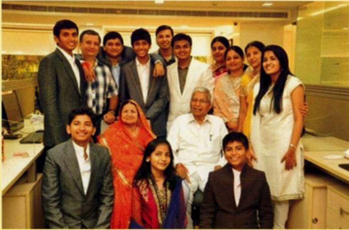
Two Younger generations helping the senior generation in its charitable activities