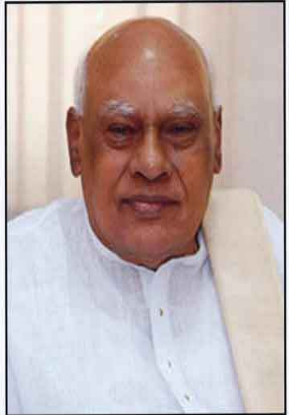
HIS EXCELLENCY THE GOVERNOR OF TAMIL NADU DR. K. ROSAIAH