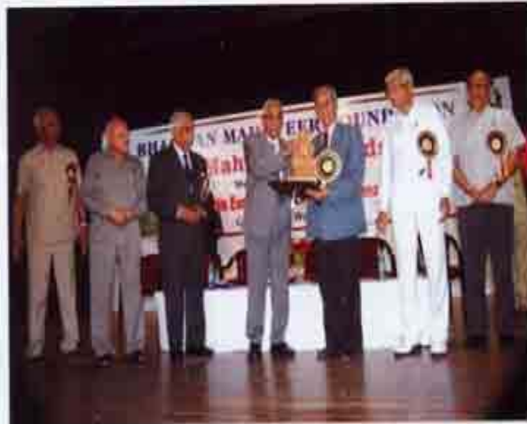
Rep. of Indian Planetary Society receiving the Fourteenth Mahaveer Award from His Excellency Sri M K Narayanan , the Governor of West Bengal for excellence in the field of Education