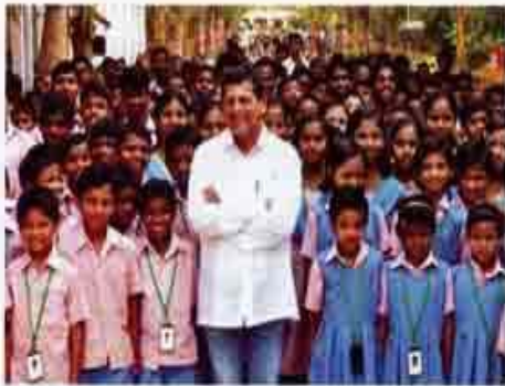
Fond Moments with students of Kalinga Institute of Social Sciences (KISS)