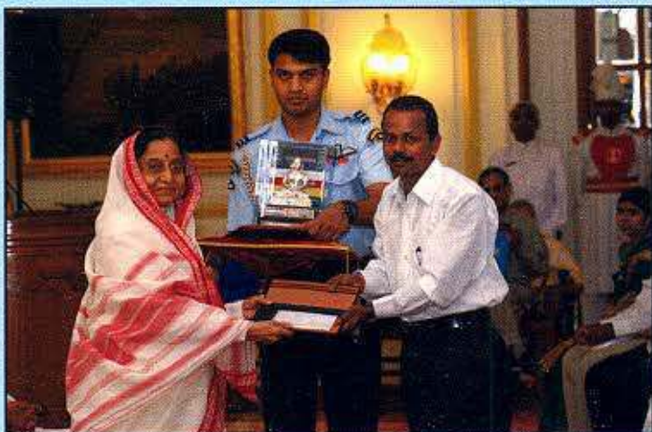
Her Excellency Smt. Pratibha Devisingh Patil, President of India presenting the 12th Mahaveer Award to Action for Protection of Wild Animals (APOWA) for excellence in the Sphere of Non-Violence and Vegetarianism.