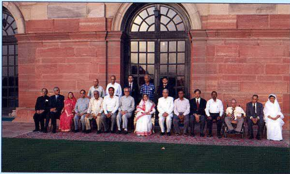
Her Excellency Smt. Pratibha Devisingh Patil, President of India with the Selection Jury Members and the Awardees