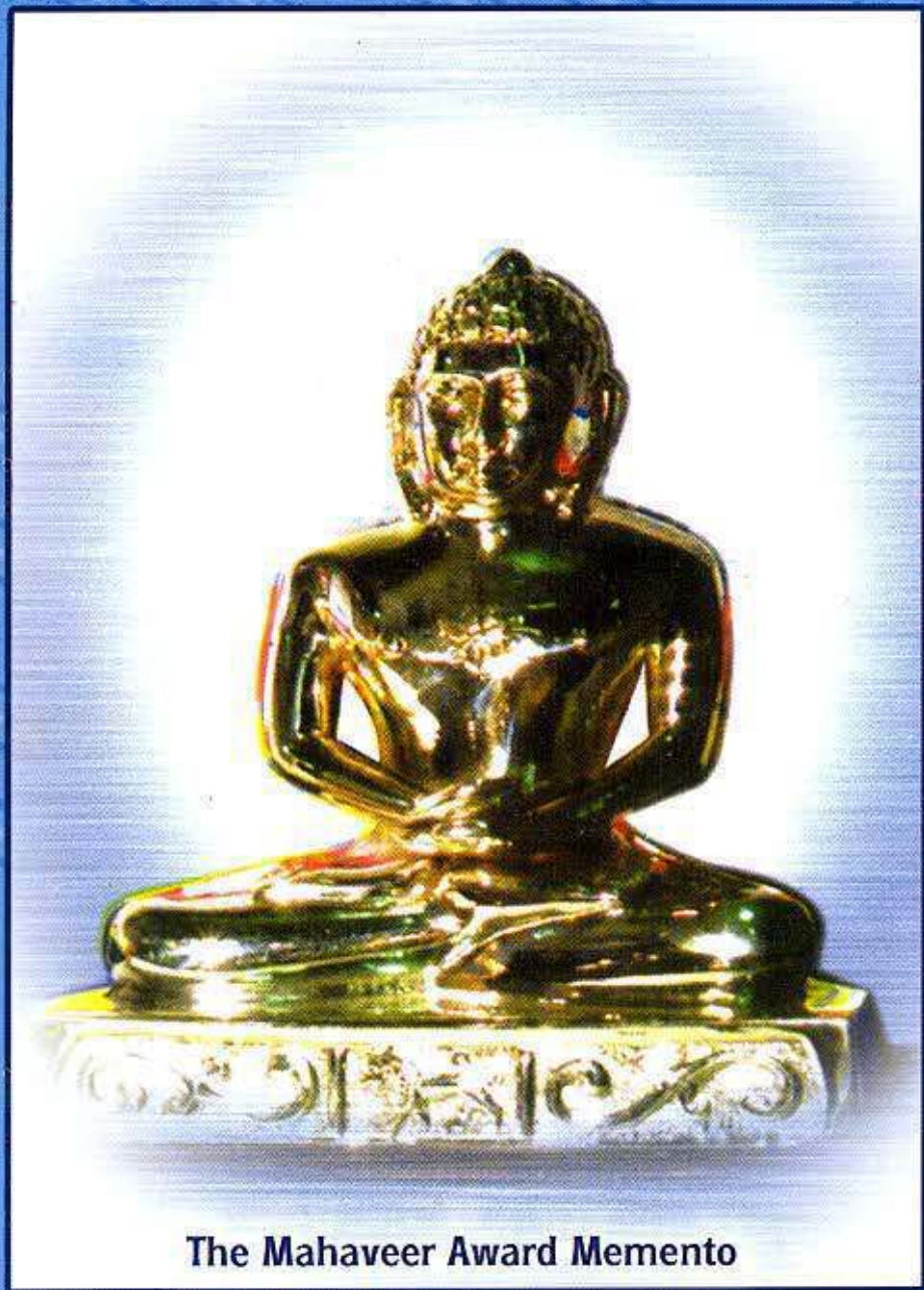
The Mahaveer Award Memento