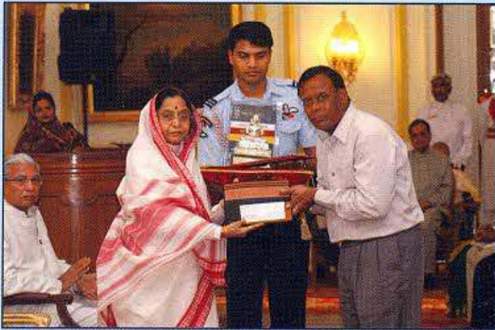
Her Excellency Smt. Pratibha Devisingh Patil, President of India presenting the 11th Mahaveer Award for excellence in the Sphere of Non - Violence and Vegetarianism.