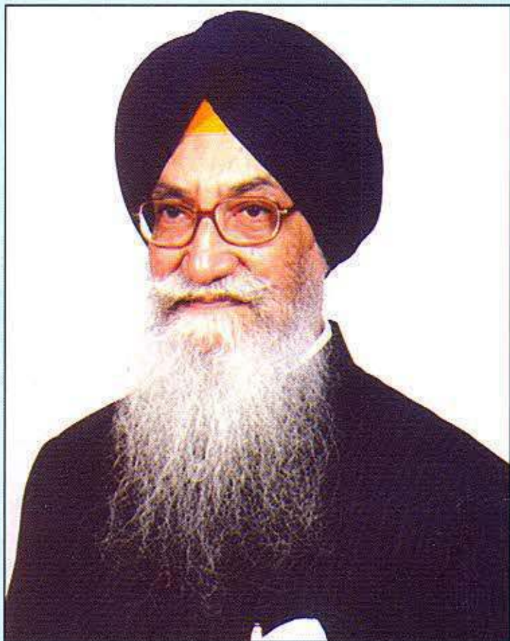
HIS EXCELLENCY THE GOVERNOR OF TAMILNADU SHRI SURJIT SINGH BARNALA