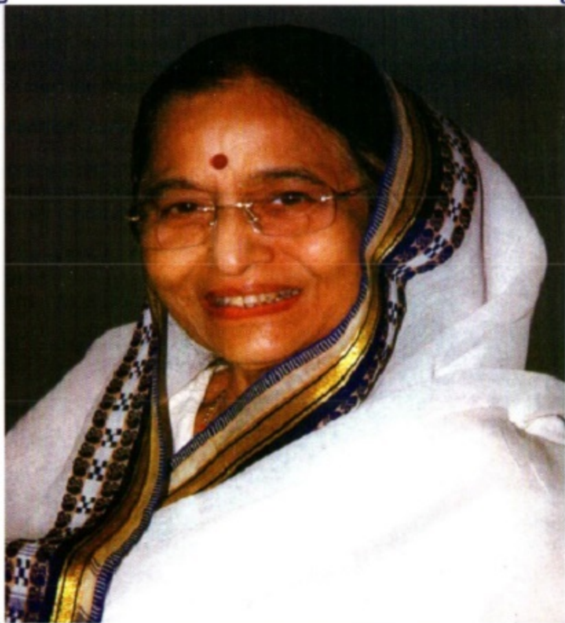
Smt. Pratibha Devisingh Patil